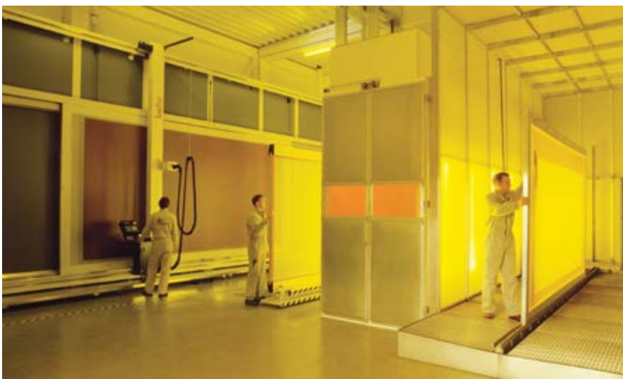
Large format stencil production